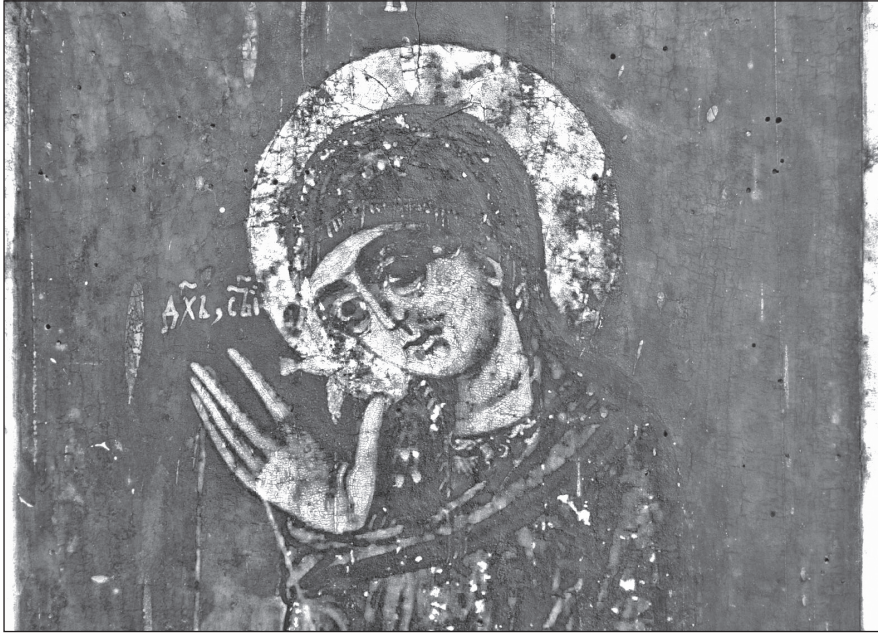
Fig. 1 Dimitrije Daskal, Holy Virgin and the dove of the Holy Spirit , detail of the Annunciation , 1704, Royal Door, Church of St Paraskeve, Mrkovi