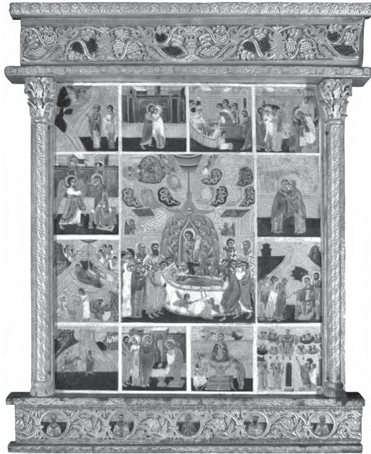
Fig. 3 Dimitrije Daskal and Gavriilo Dimitrijević, Dormition of the Virgin , 1713, icon in a carved frame, Morača monastery church