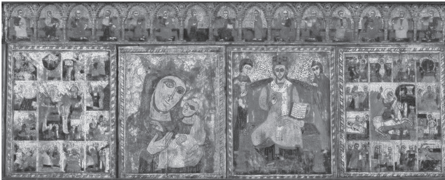
Fig. 10 Ivo Rafailović (?), Polptych that serves as a home altar, second half of the nineteenth century, National Museum, Cetinje