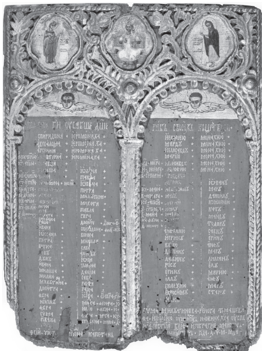
Fig. 5 Georgije Dimitrijević, Icon with a carved frame inscribed with the names of the deceased, 1740, Treasury of the Savina monastery