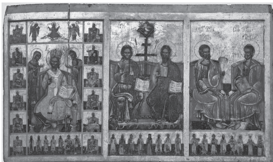
Fig. 6 Petar Rafailović, Triptych , 1776, Banja monastery near Risan