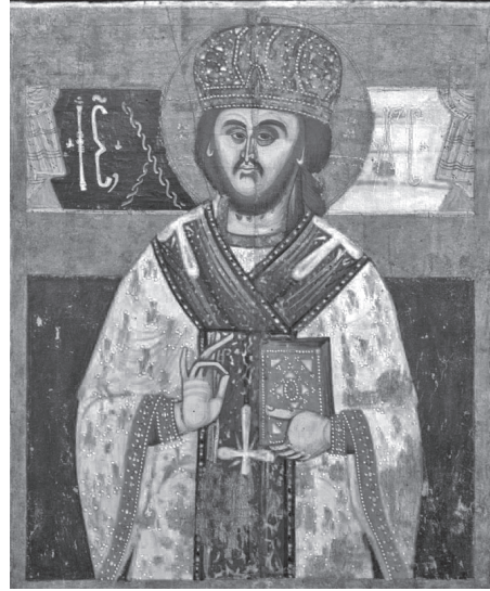
Fig. 7 Vasilije Rafailović (?), Three-Headed Holy Trinity , detail of the icon of the Holy Virgin of the Sign , ca 1800, Church of St George, Sutvara