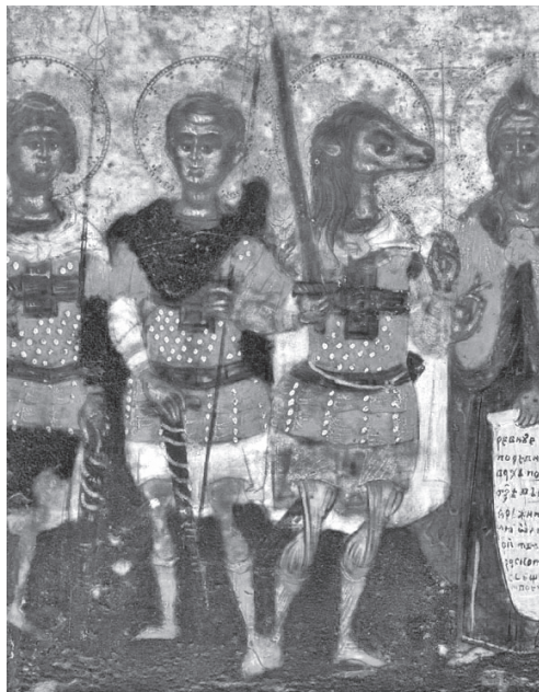
Fig. 4 Rafailo Dimitrijević, St Christopher the Cynocephalus , detail of the Deesis with saints , first half of the 18th century, Art Gallery, Split