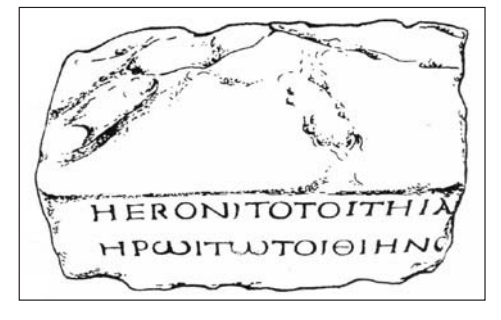
Fig. 4 Inscription from Svilengrad (drawing after Gerasimova 1999, p. 16, fig. 2)