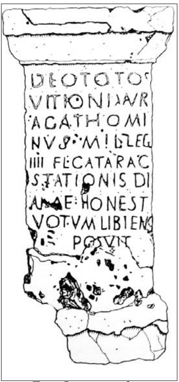
Fig. 2 Inscription from Djerdap Gorge (drawing after V. Kondić 1987)