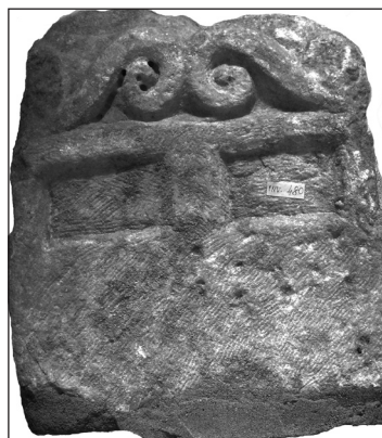
Fig. 2 Persephone and Pluto , marble, Viminacium (detail)