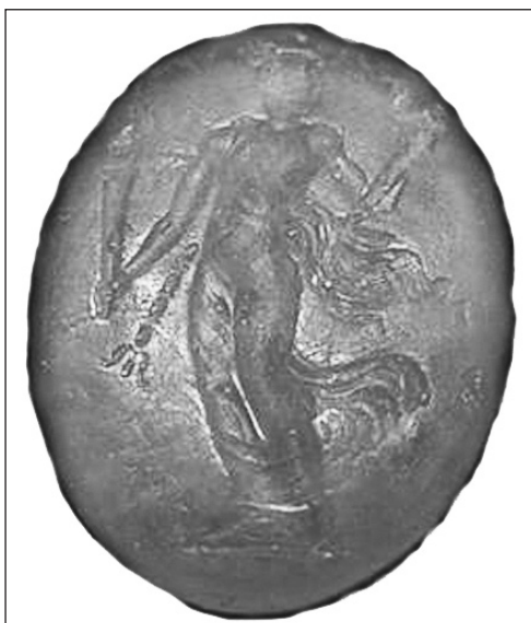
Fig. 4 Persephone , relief mirror made from precious metals, Viminacium