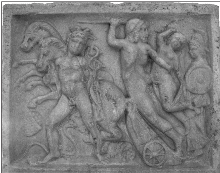
Fig. 1 Abduction of Persephone , marble relief from the stele of Marcus Valerius Speratus, Viminacium