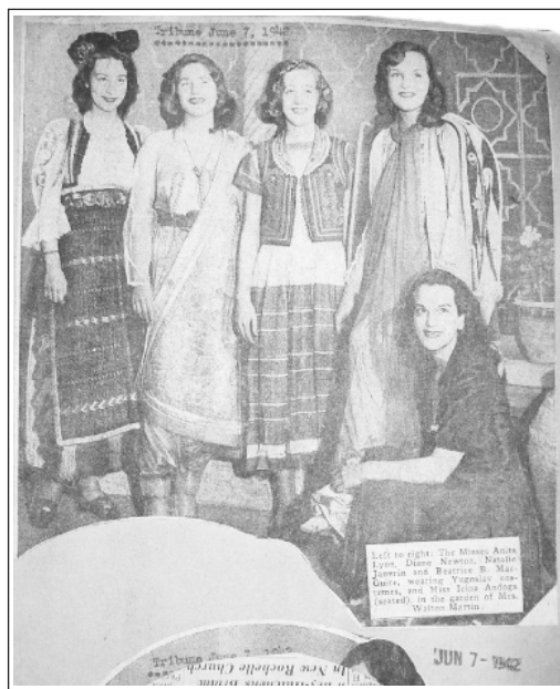
Fig. 4 Fundraising in Yugoslav folk costumes

of the greatest stylists of the English language and published regularly in the New York Herald Tribune , New Republic , and in many newspapers in her native London. Rebecca West's popular travelogue, even today one of the 100 most read books of the century, contributed greatly to the Balkan Myth, the image of the Balkans as a place of death, martyrdom, sacrifice. Though employing such imagery in describing resistance to the Nazis, West personally believed the Allies should "fight for life, not for martyrdom," and thus sought to present the Chetniks as fighters who rejected