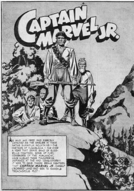
Fig. 3 Captain Marvel featuring the Chetniks. DC Comics: Master Comics, no. 36 (Feb. 1943)

The Cost of Our Yugoslav Blunder” were still very common. 19