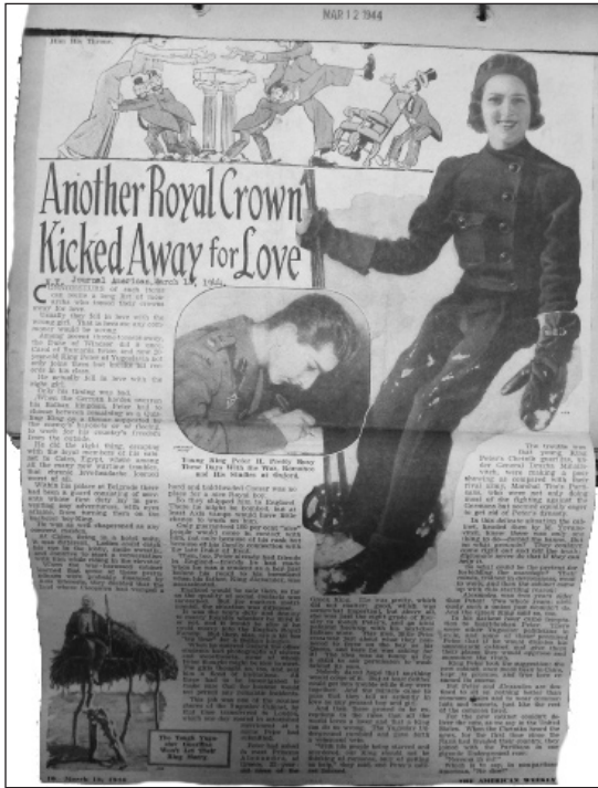
Fig. 8 "Another Royal Crown Kicked Away for Love", American Press , March 12, 1944.

timing was bad. Fierce male resistance warriors in Yugoslavia, following their non-romantic code of ethics believed that it was not appropriate for a king to marry while the liberation struggle was still going on. According to the American Weekly ,