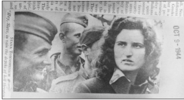
Fig. 6 Stana Tomašević, Tito’s Partisans’ top “photo model”

Gender was defined very differently in the public relations of the Partisan movement. Stana Tomašević was a famous Partisan fighter and also a model, whose photographs appeared on the pages of many American newspapers. 22 According to the British liaison to Tito’s Partisans, Fitzroy Maclean, the photographs of Tomašević contributed considerably to the positive opinion about Yugoslav Partisans. Stana Tomašević was not the only Partisan woman that was photographed, there were others, such as Mira Afrić, but their number was limited, and a few of the carefully staged photographs were widely circulated. 23 The impression that was conveyed to the public was that fighting women accounted for as much as a quarter of Tito’s armies. In many of her pictures Stana Tomašević was photographed professionally and with extensive preparation by the war photographer John Talbot. The fact that there were many women in Tito’s army was repeatedly emphasized in the press. Those women were not just helping and supporting the men, they were fighting. They left the kitchen for the front and there was no domestic life for them until the victory was won. We would say today, they also fought hard. In fact, Mihailović was often criticized among the Partisans for leaving his wife at home. Throughout the war, the