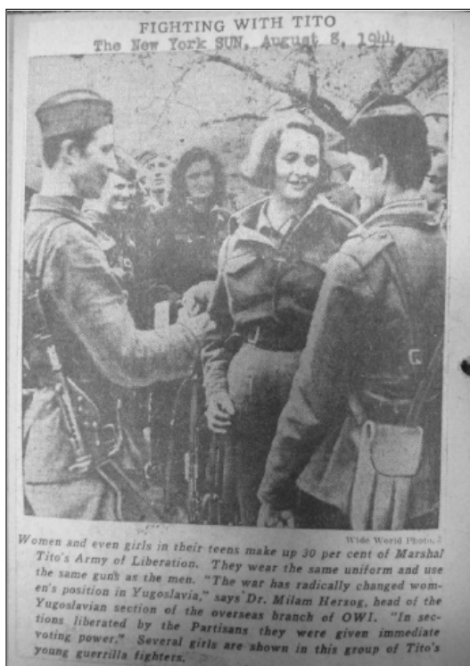
Fig. 2 Tantalizing picture of Tito's female partisans in the New York Sun of August 8, 1944

The liberation of Yugoslavia, however, did not come as a result of the Allied landing in the Adriatic, but as a result of the push by the Red Army through Serbia. Once installed in Belgrade with the help of the Red Army, Tito changed his attitudes, and became much more aggressive toward the Western Allies, even threatening the Allied positions in northern Italy toward the end of the war. Warnings about Tito, present from the beginning, now filled the pages