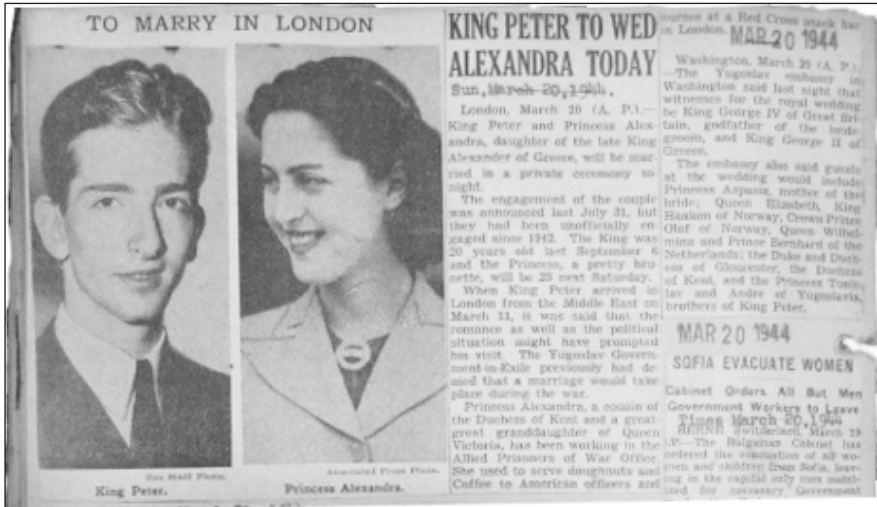
Fig. 7 The story of the royal wedding was somewhat of an obsession for the American press

During the war, this new type of women, which the Partisans promoted, fitted well with the image of the new woman emerging during the New Deal period. Women were no longer members of the family, where the male was the head, but breadwinners themselves. They joined the workforce, first during the Great Depression, when the man was not able to provide enough, and then during the war, to help the war effort. Therefore, a stark contrast was drawn between the domestic upper-class women, who supported the Chetniks with their fundraising, and the determined and beautiful ordinary women, who joined the Partisans. In short, Vladimir Velebit and Louis Adamic hit the jackpot with the image of Partisan women in the American press. They presented that image at the right time for their cause, because the image of a free warrior woman would be eclipsed in American culture by the post-war image which saw “Rosie the Riveter” leaving the workforce and returning to the role of demure and domesticated householder.