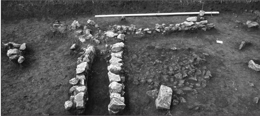
Fig. 1 Trench 2: Central drainage channel along a SW-NE axis (view from the east)

The discovered system of two perpendicular drainage channels might suggest a major, inter-urban, and a minor, intra-settlement, road that intersected at a right angle and, naturally, used to be furnished with deeper drainage channels (Chevallier 1997: 124). The larger channel into which the smaller one discharged ran towards the Timok, where excessive rainwater, and possibly liquid waste, was obviously discharged.