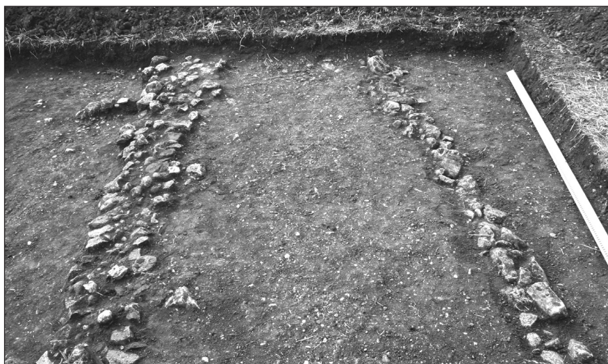
Fig. 2 Trench 3: Possible SW-NE intra-settlement communication in Timacum Maius (?)

Roman road, excavation in that zone was cancelled in order to be resumed in a more broadly designed campaign which would establish its exact position in relation to the settlement and its possible importance in the process of urbanization.