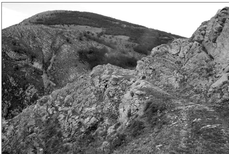
Fig. 2 Remains of the road viewed from the Svrlijig Fort

From the abundant archaeological material, especially coins, the site of Niševac can be dated to the sixth century BC all through to the nineteenth century AD. The oldest Roman coins date from the reign of Mark Anthony and Augustus. 18 The most plentiful and best preserved archaeological material comes from the Roman period. Noteworthy is also an ara dedicated to Jupiter, which has been dated to the third century AD. 19 Seen in a broader geographical context, the site of Niševac should be considered as forming a whole with the Svrlijig Fort and the site of Banjica. 20