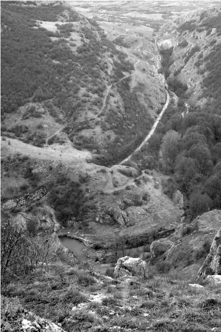
Fig. 3 Remains of the road viewed from the Svrlijig Fort, and below it, the modern railway built in the 1920s