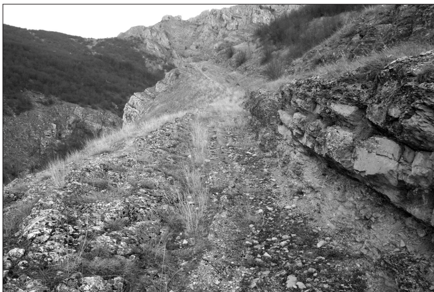
Fig. 1 Remains of the road with visible embankments at the entrance to the Svrnjiški Timok gorge

tioned at Ravna (cohors II Aurelia Dardanorum). 9 In the far northeast of the region was the land of the Moesi , where the town of Ratiaria (Ratiaria, colonia Mesorum) developed, modern Arčar on the Danube. The confluence of the Timok and Danube rivers was inhabited by the Little Scordisci , a branch of the powerful Celtic tribe who had settled in present-day Srem (region between the Danube and the Sava) in the fourth century BC. 10