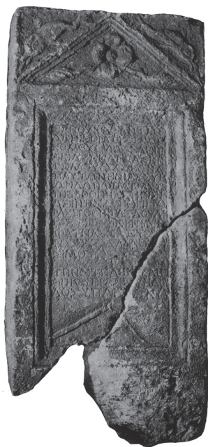
Pl. 5 Stela from Singidunum (IMS I 70)