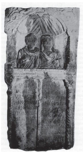
Pl. 3 Stela from Singidunum (IMS I 52)