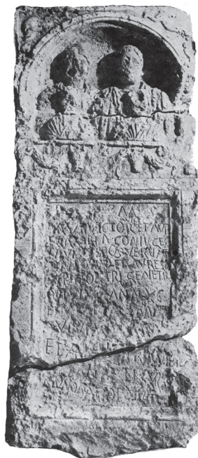
Pl. 2 Stela from Singidunum (IMS I 41)