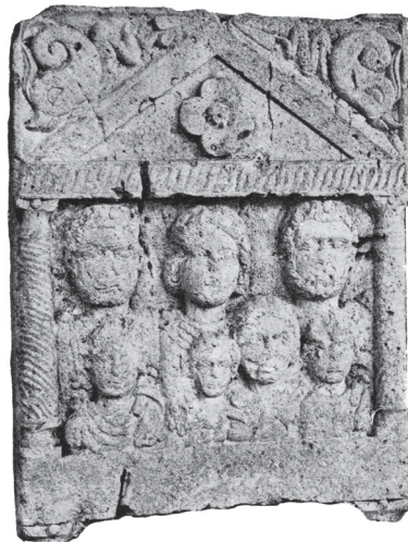
Pl. 12 Stela from Viminacium (IMS II 190)