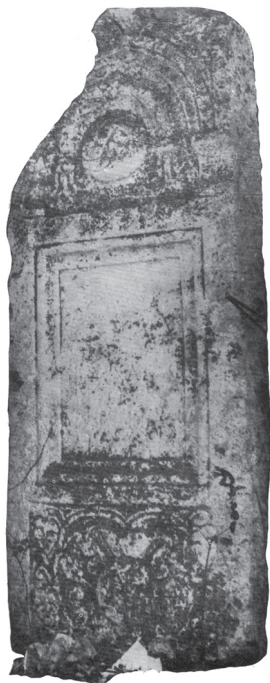
Pl. 1 Stela from Singidunum (IMS I 34)