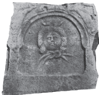
Pl. 15 Stela from Ratiaria (Димитров 80/27)