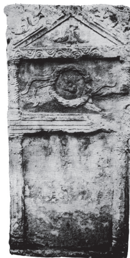
Pl. 4 Stela from Singidunum (IMS I 56)