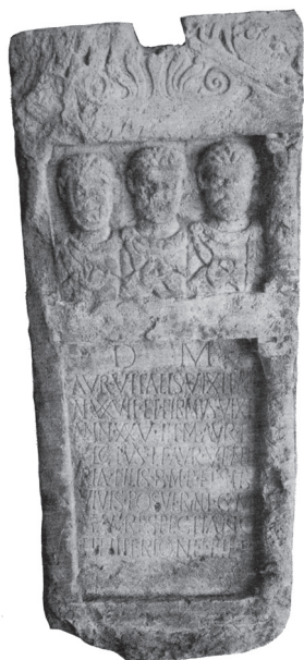
Pl. 7 Stela from Kosmaj (IMS I 125)