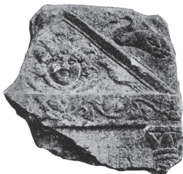
Pl. 13 Stela from Viminacium (IMS II 200)