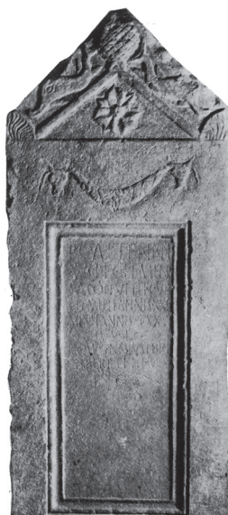
Pl. 16 Stela from Scupi (IMS VI 51)