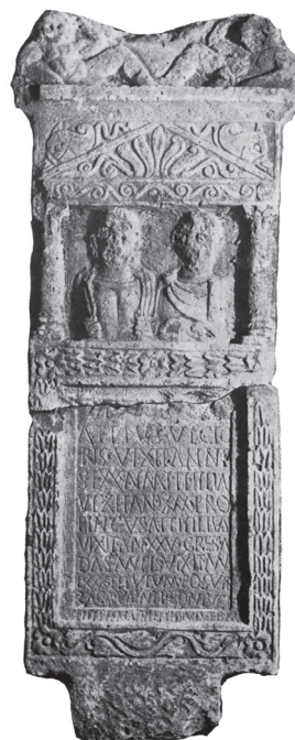
Pl. 6 Stela from Kosmaj (IMS I 122)