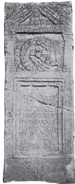
Pl. 10 Stela from Viminacium (IMS II 128)