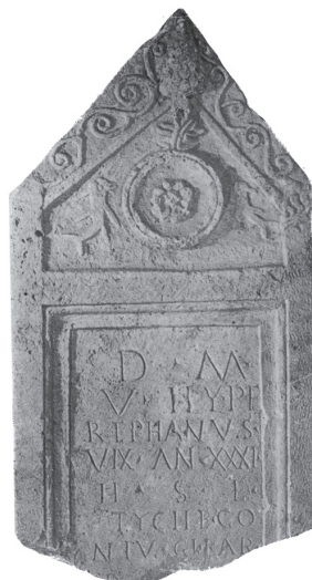
Pl. 17 Stela from Scupi (IMS VI 157)