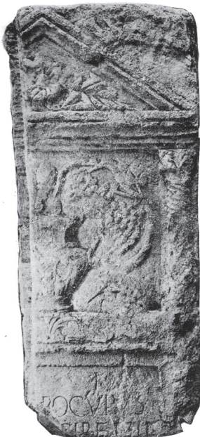
Pl. 11 Stela from Viminacium (IMS II 179)