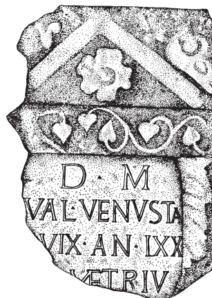
Pl. 8 Stela from Kosmaj (IMS I 133)