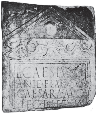
Pl. 9 Stela from Viminacium (IMS II 89)