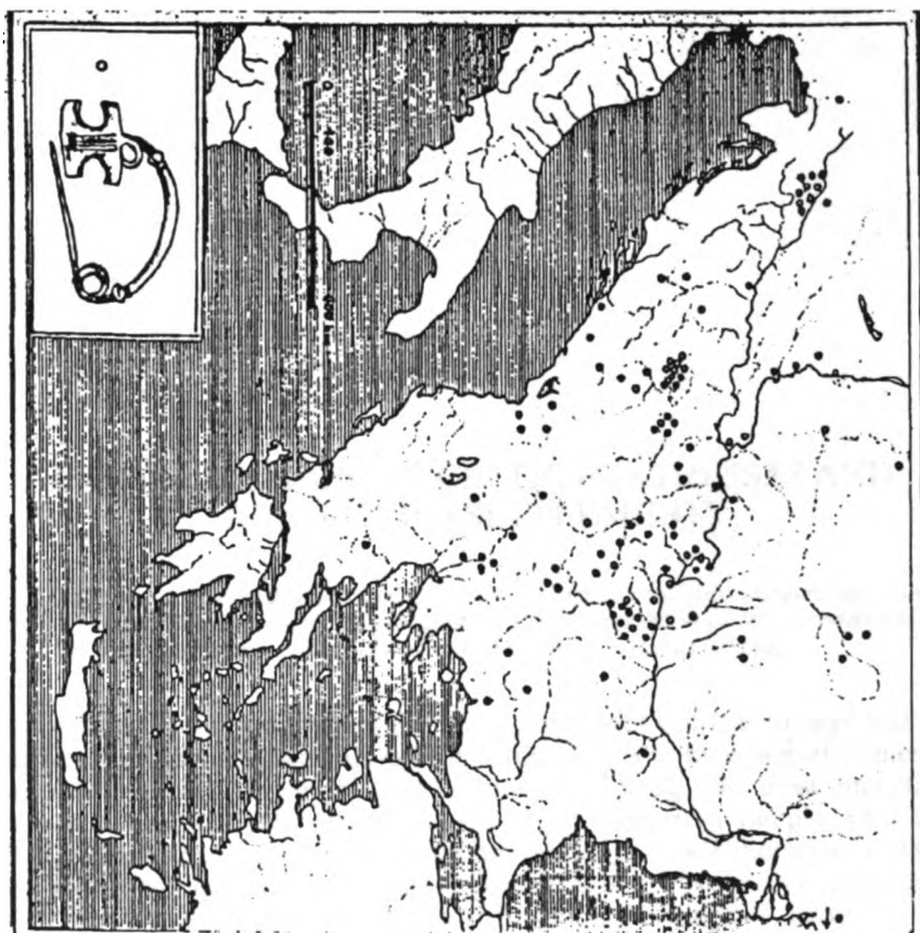
Fig. 2 The distribution of two-piece arc fibulae with stilts in the shape of Boeotian shields